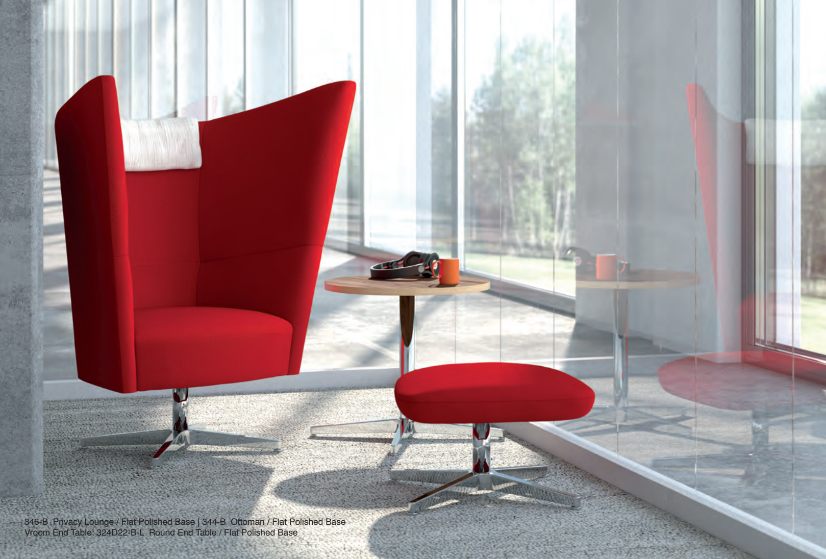
346-B Privacy Lounge / Flat Polished Base | 344-B Ottoman / Flat Polished Base Room End Table: 324D22-B-L Round End Table / Flat Polished Base